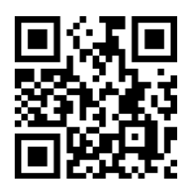
Table Talk: Family Conversations About Current Events | Race, Perception and Implicit Bias

The ADL tackles different forms of implicit bias and offers prompts for starting conversations on these topics.